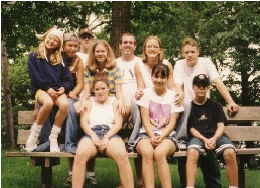
Break time at Youth Council Camp in Annandale