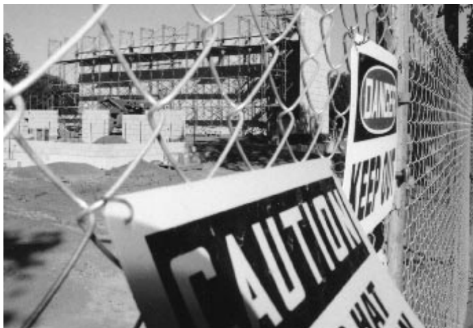
The $2 million renovation project at Hale School Began in July and will be completed next fall,. The north wall of the new gym begins to take shape in the background.