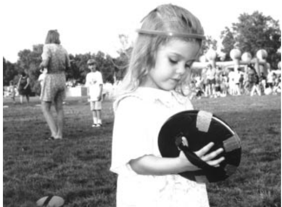
A quiet moment for reflection at the 1997 Picnic in the Park

The park survived (the sun came out that morning, dried the ground sufficiently, lasted until that evening, and was engulfed by clouds again the next day). A record setting 2,306 people registered, while 2,800 people were estimated to have participated. We raised a record $1,500.