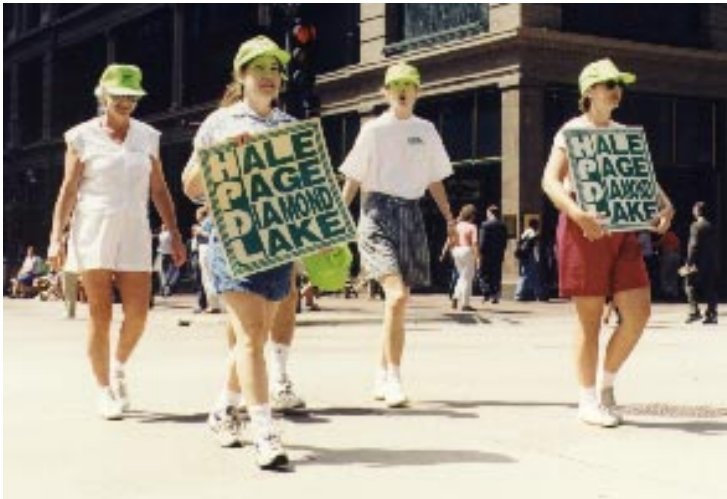
The HPDL Walk Patrol marched in a National Night Out Parade Aug. 4 in downtown Minneapolis.