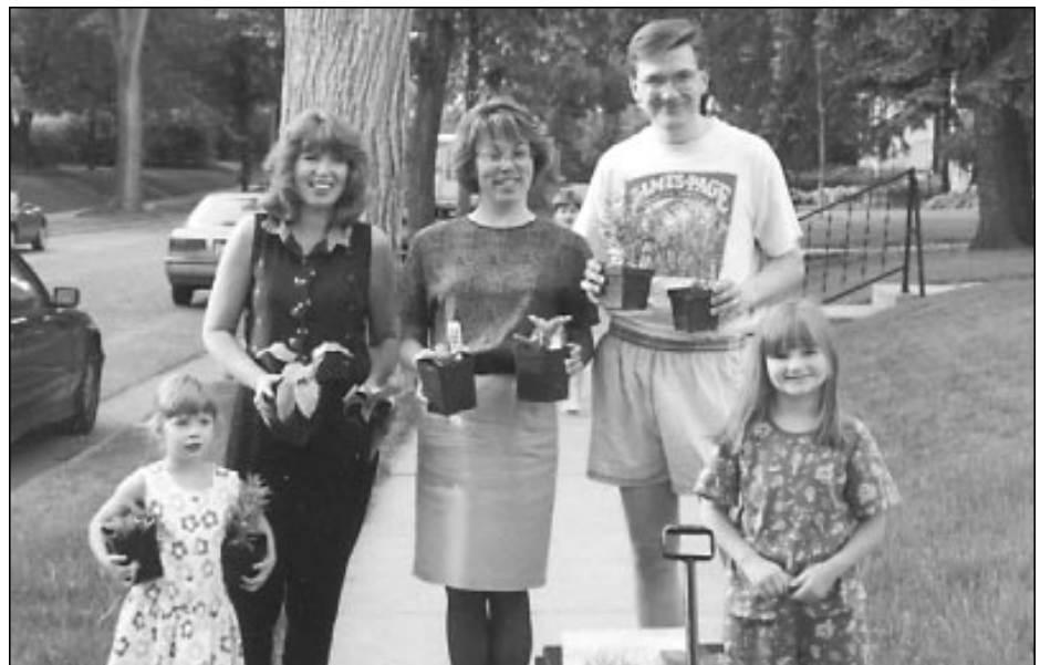
Plant an HPDL Block Grant on your boulevard!

If you have any interest in being a part of the Building Community Committee, please feel free to join us on the last Wednesday of each month at the HPDL offices from 7-9 p.m., or call the office at 824-7707 for more information.