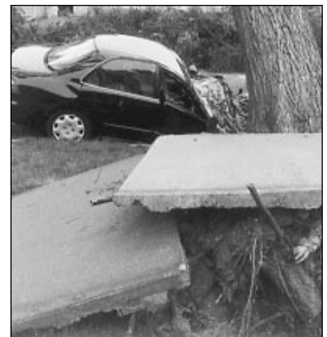
Nature toppled trees and crushed cars.

Karen Pritz lives and gardens in the Page Neighborhood with her husband, two kids, and two cats.