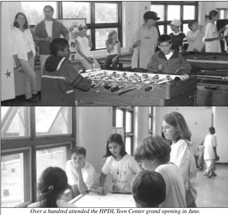
Over a hundred attended the HPDL Teen Center grand opening in June.

BULK RATE U.S. Postage PAID Mpls., MN Permit No. 4376