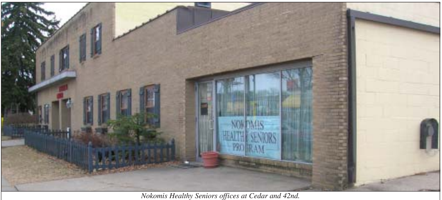
Nokomis Healthy Seniors offices at Cedar and 42nd.

In the spirit of reducing waste, please remember to bring your own mug to the programs.