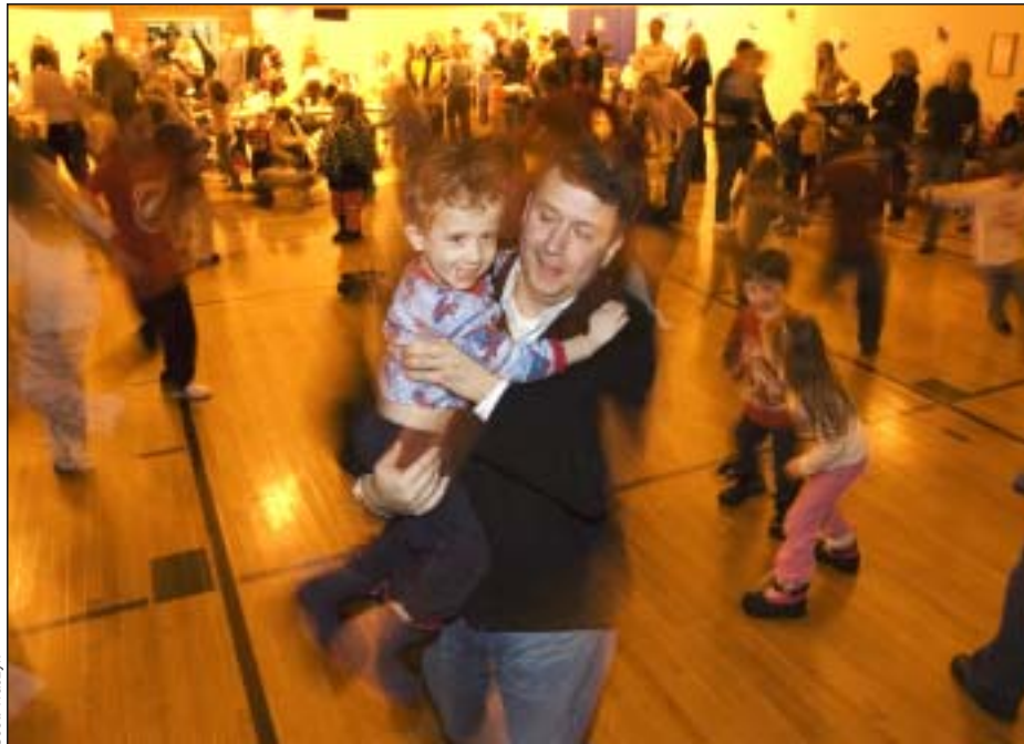
Dancing at Frost Fest.

Frost Fest was coordinated by The Hale, Page, and Diamond Lake Community Association, the Minneapolis Park Board and Pearl Park, and the Pearl Improvement and Recreation Council.