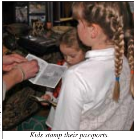
Kids stamp their passports.