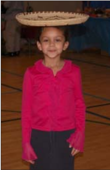
Kids get a chance to explore world culture.