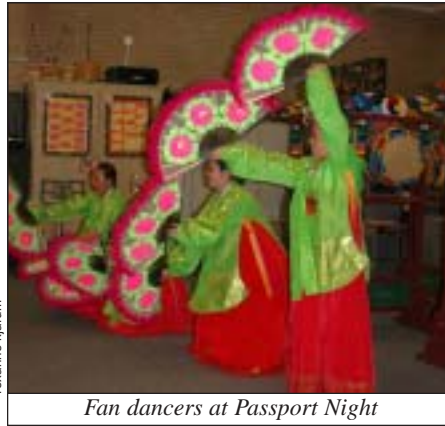
Fan dancers at Passport Night

Come and join us for one of Hale School's most exciting and well-attended events. Hale students and their families will explore different cultures and countries as they visit ethnic display booths and listen to multi-cultural entertainment. We will also have an array of ethnic treats and some special arts and crafts to keep everyone busy!