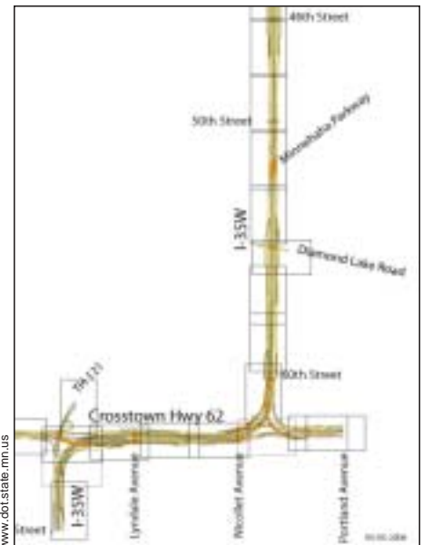
Bridges at 46th, 50th, Minnehaha Creek, Diamond Lake Road, 60th, and Portland will be torn down and replaced during the 4 year project.