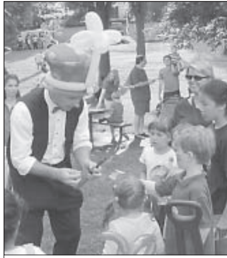
Balloon animals at the 2002 Picnic.

there will be grilled corn on the cob, watermelon, pizza, pop, beef hotdogs and popcorn to purchase.