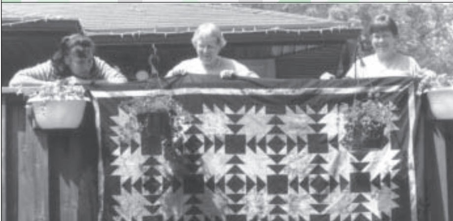
HPDL Quilters will raffle off this beautiful quilt at Picnic in the Park.