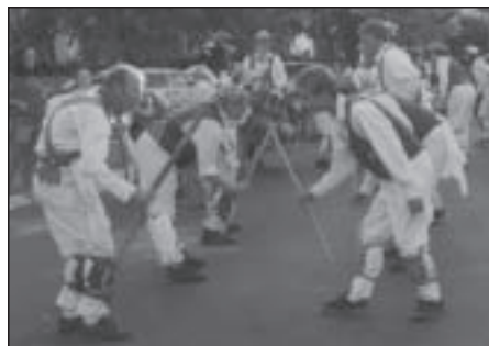
Dancers at Picnic in the Park

Come to Pearl Park on July 31, 2003 from 5:30 p.m. to 8:30 p.m. to join in the fun. See you there!