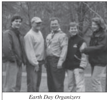
Earth Day Organizers

A warm thank you also goes out to Kowalski’s Market at 56th Avenue South and Chicago Avenue for their donation of over 200 rolls for breakfast and to Pepitos Restaurant on 48 th and Chicago for their donation of burritos, chips and dessert for over 100 volunteers. Of course, thank you to all of the volunteers who turned out on Earth Day to help keep our beautiful natural resources clean!