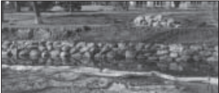
Fences will come down soon.

At Minnehaha Creek immediately west of Cedar Avenue, the silt fences will be removed as soon as vegetation is established. High water last fall caused the seeding to wash away, requiring reseed-ing and delaying turf establishment. The Minneapolis Park Board is monitoring plant growth and will remove the fences as soon as plants are adequately established to prevent erosion.