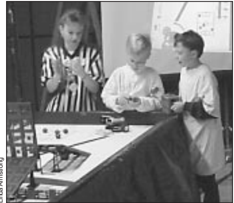
Two Hale students prepare their robot.