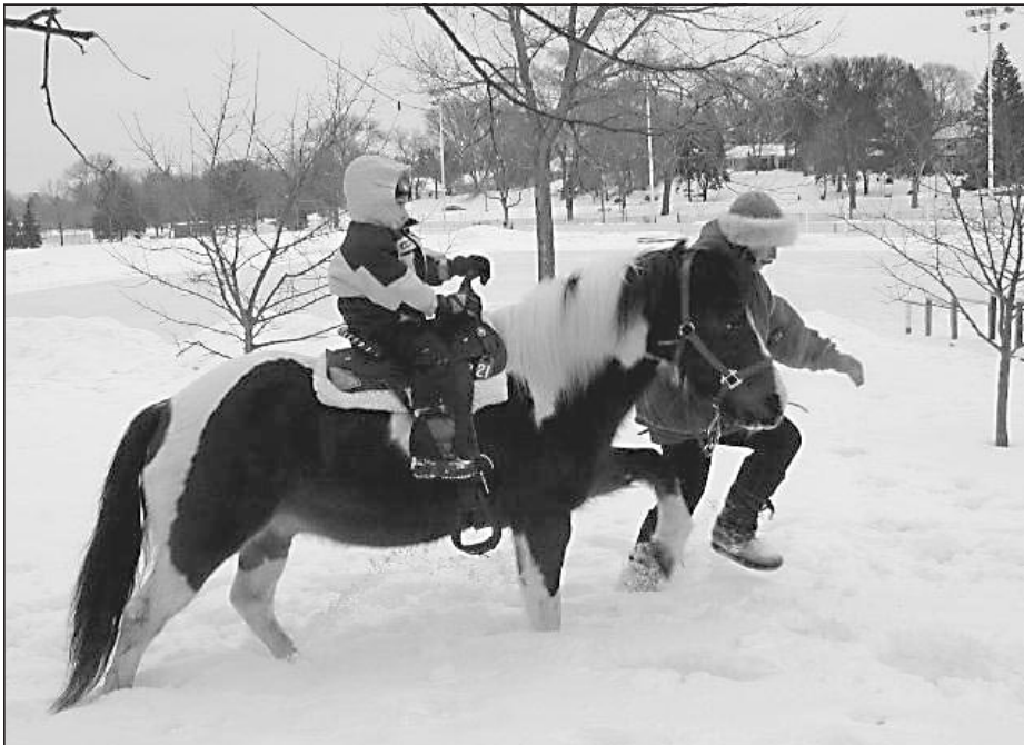
Horse rides were a new addition to Frost Fest 2001.

Hot dogs, pop, hot chocolate, chips, and popcorn will be sold throughout the event. All games with prizes and face painting are $0.25, and pony rides are $1.00. All other activities are free. If you have questions, please call the HPDL Office at 612-824-7707.