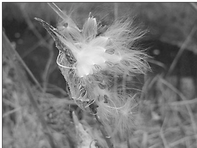
Louise Lystig Fritchie

Sitting at a computer can be cold and heartless. A computer is, after all, a machine. What magic it is then, when this heartless machine sprinkles moon dust, via the Internet, no less. For the connected, it's at: www.bylakenokomis.com .