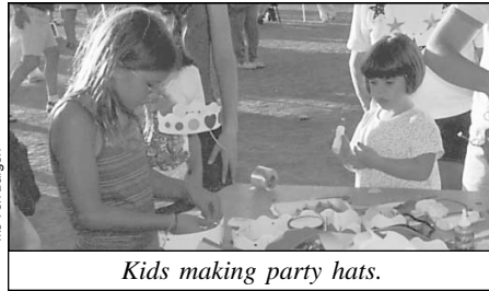
Kids making party hats.