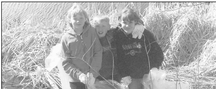
Other volunteers cleaned the shores.