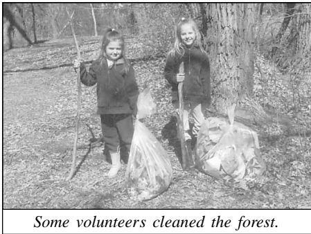
Some volunteers cleaned the forest.

Our annual Earth Day Clean-up was probably the biggest success the event has ever seen. Last year we had 15 brave volunteers show up on a rainy Saturday morning. This year, the number jumped to a gigantic 109 who came out to help clean up the shoreline of Diamond Lake, along Minnehaha Creek, and around Todd Park.