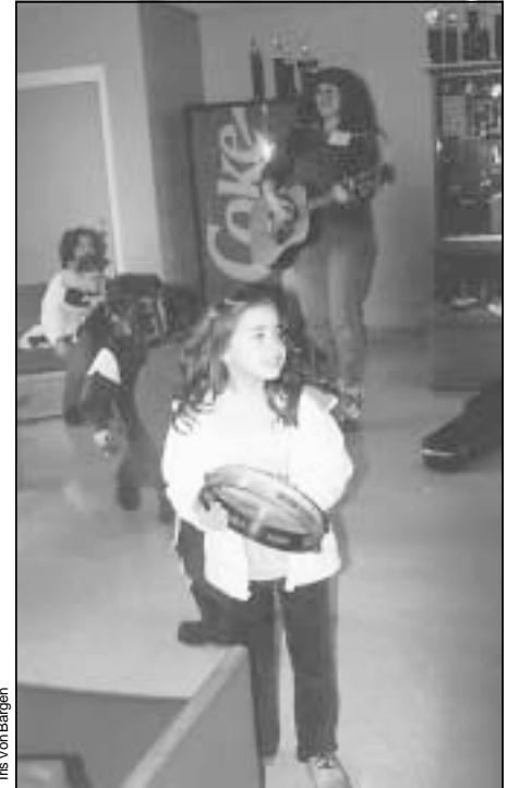
Music for FrostFest.