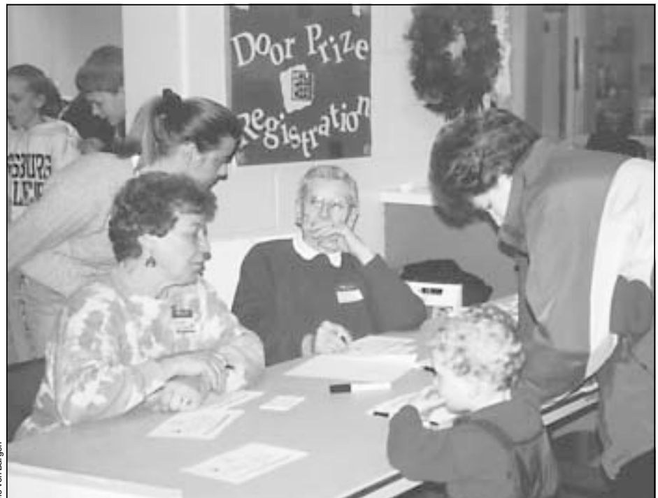
The registration desk at FrostFest was a busy place.