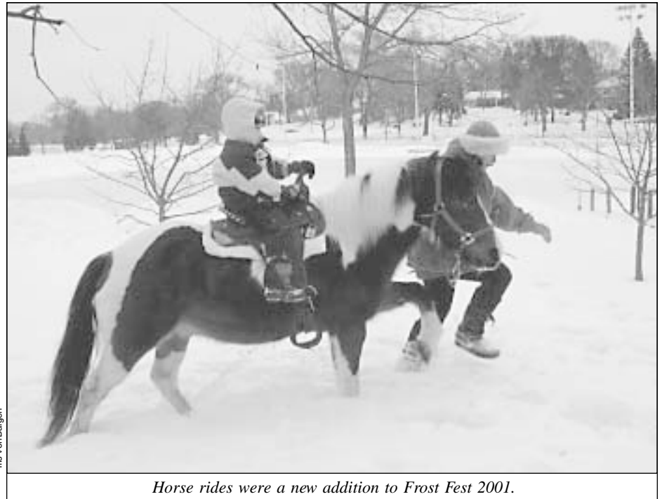
Horse rides were a new addition to Frost Fest 2001.