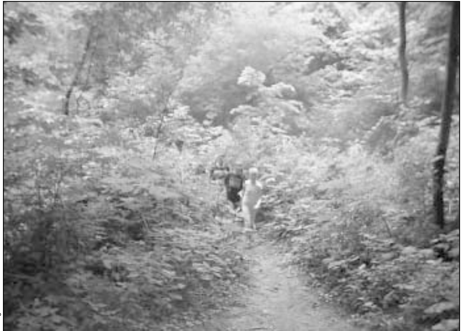
Deep in the woods of HPDL it's possible to imagine you're lost in a wilderness.