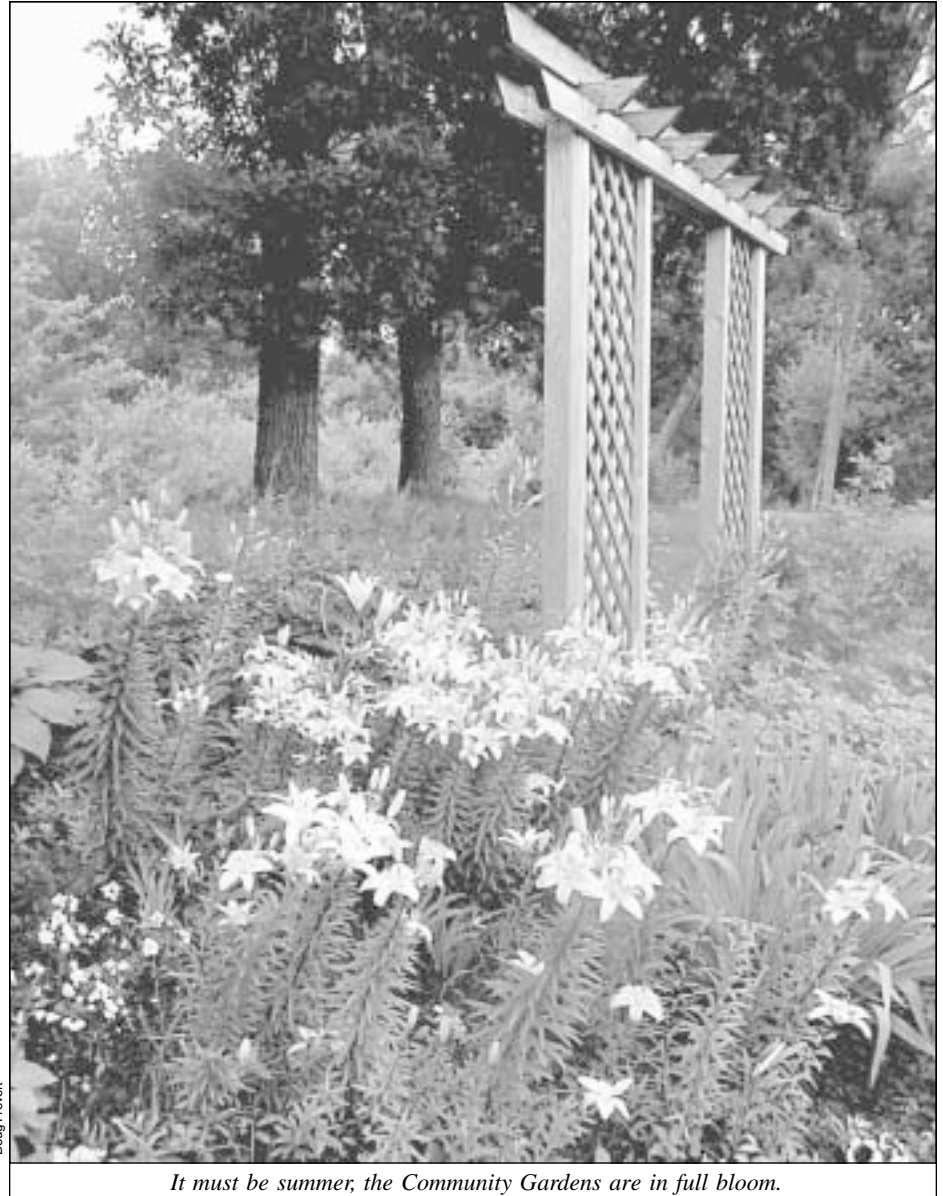
It must be summer, the Community Gardens are in full bloom.

The garden will need a fall clean-up and preparation for winter, as well as continued watering. Your time is needed at either the Parkway or Pearl site. Contact HPDL (824-7707) to sign up with the adopt-a-garden program.