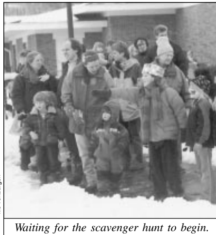
Waiting for the scavenger hunt to begin.