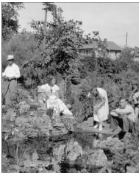
Bush's Nursery on 40th & Bloomington