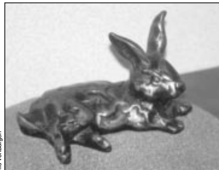
Artist's model of the "Bronze Rabbit"

The site. The committee chose a site on the southeast corner of the Portland and Minnehaha Parkway intersection, just downstream from the water pump. Look for the installation to begin next Fall.